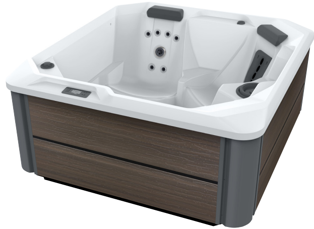
SX spa shown with Alpine White shell and Havana cabinet.